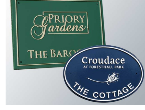
Showhouse Signs with bespoke logos

To make an enquiry, call us on 01525 874185 or email us - enquiries@sott.co.uk