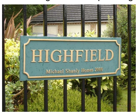
Estate Entrance sign