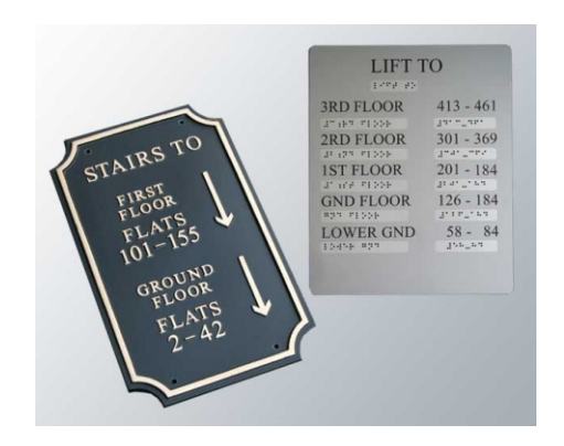
Internal Signs - cast with relief or Perspex with added braille