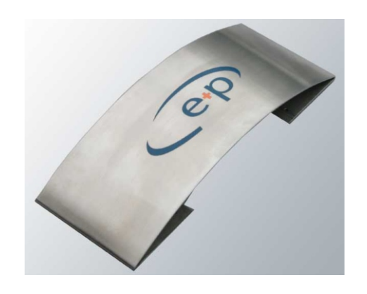
Brushed Stainless Steel Etched & filled with colour Curved