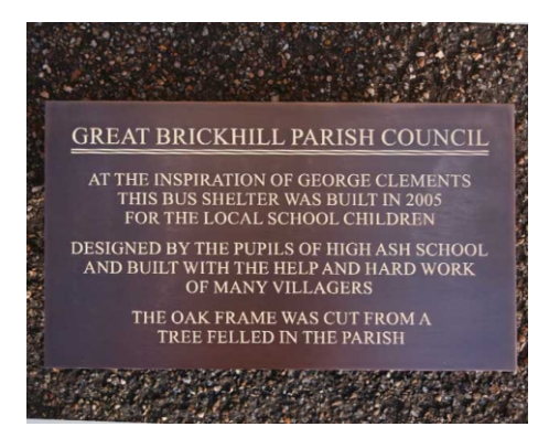
Bronze plaque Etched and filled cream