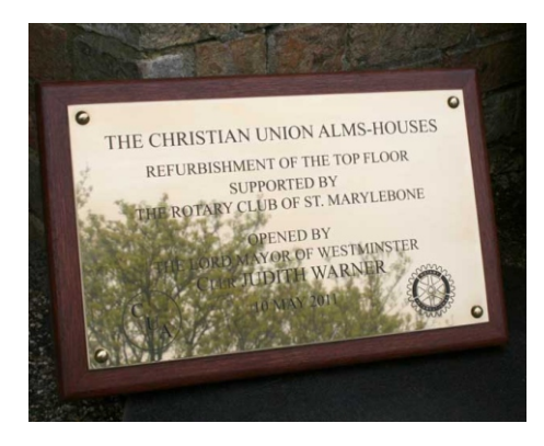
Polished Brass with detail etched and filled black. Mounted onto a hardwood plaque using brass dome headed screws

Etched metal signs meet many requirements other than 'standard' office or building signs.