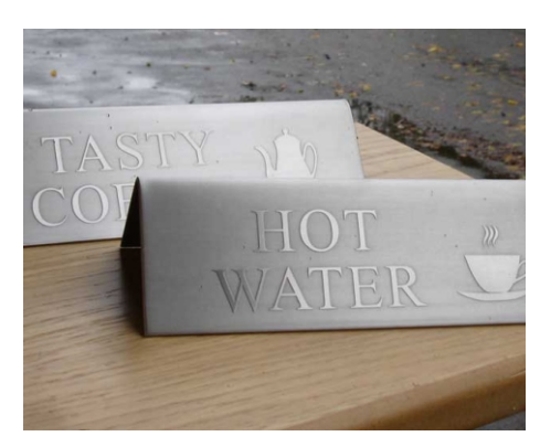
Stainless Steel Reverse etched (background is etched away to leave detail in relief)