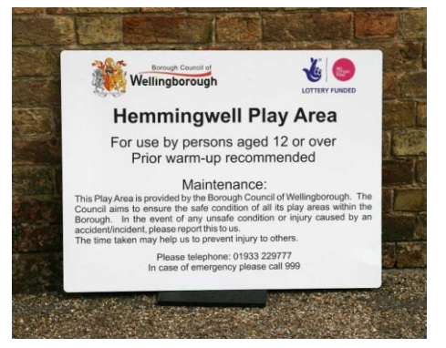
Aluminium sign with printed detail to the face