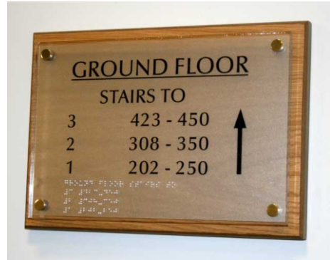
Perspex sign mounted onto an oak backing board